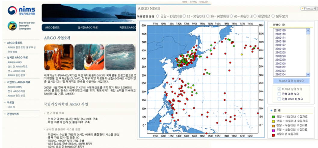
Fig. 3. Argo homepage of NIMS/KMA ( http://argo.nims.go.kr )