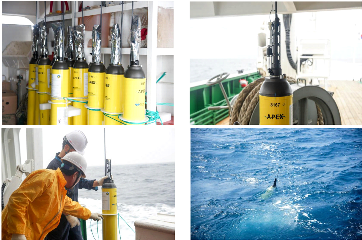
Fig.2. Several snap shots of the NIMS/KMA's Argo float deployment in 2017